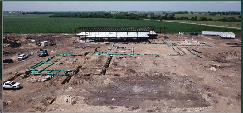
Aerial looking North _ 04.26.2023