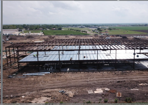
Steel & Decking (Area B) _ 04.26.2023