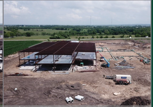
Steel (Area B) _ 04.26.2023