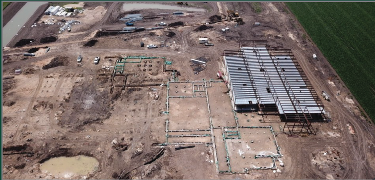
Aerial looking West _ 04.26.2023