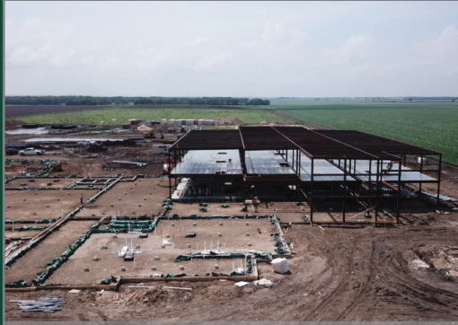
Grade beams (A & C) & Steel (B) _ 04.26.2023